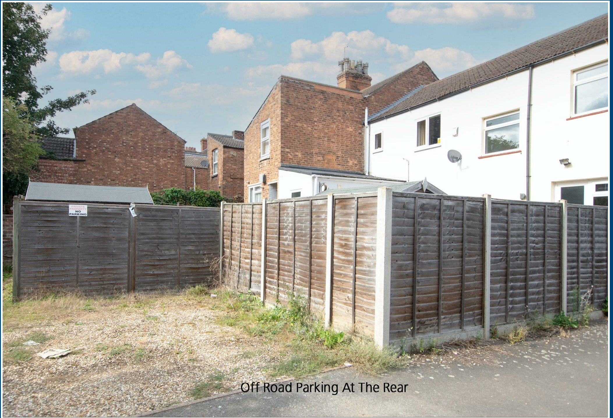
Off Road Parking At The Rear